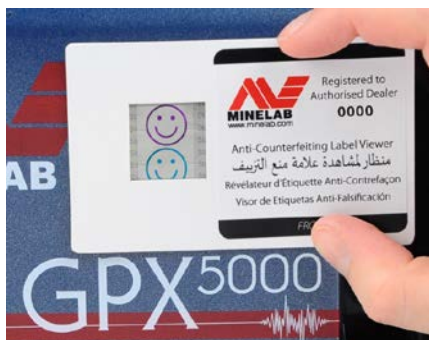
GENUINE MINELAB – when using the special security Viewer, a full colour picture on a silver background (no tint) appears in the window.